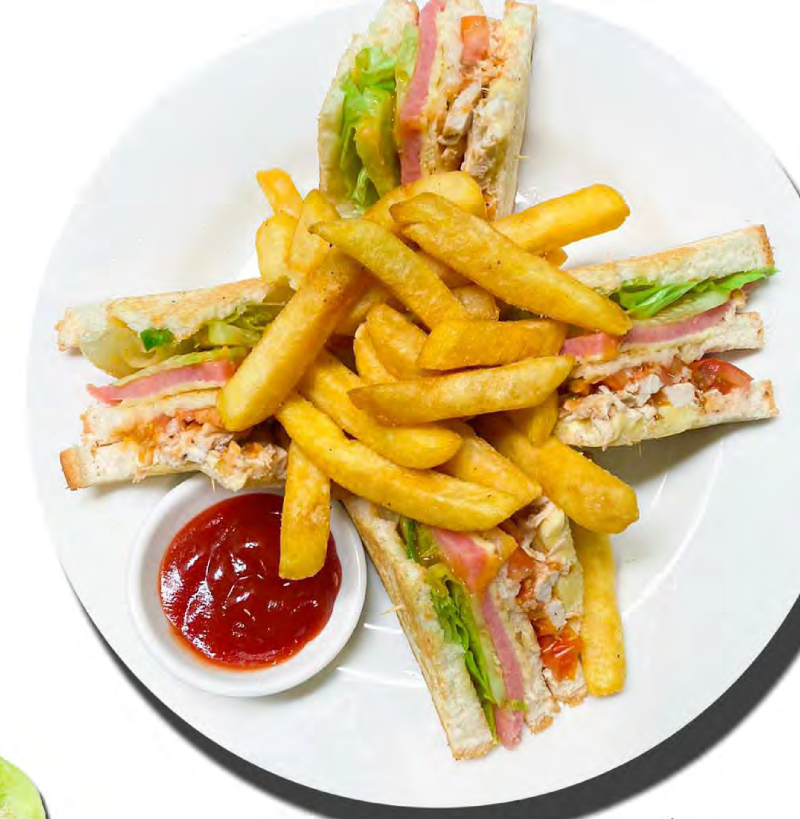
S1. CLUB SANDWICH