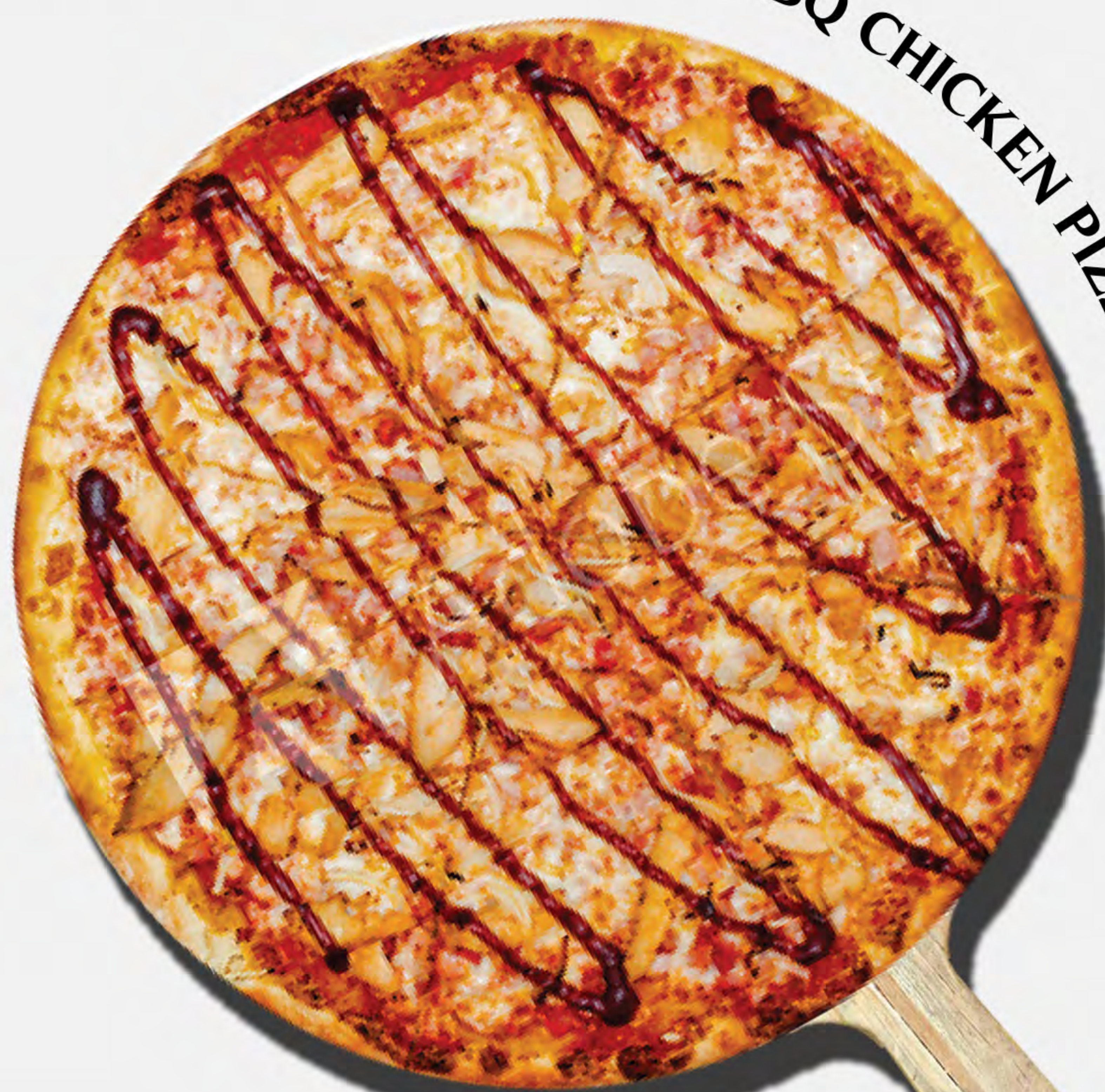
P10. BBQ CHICKEN PIZZA