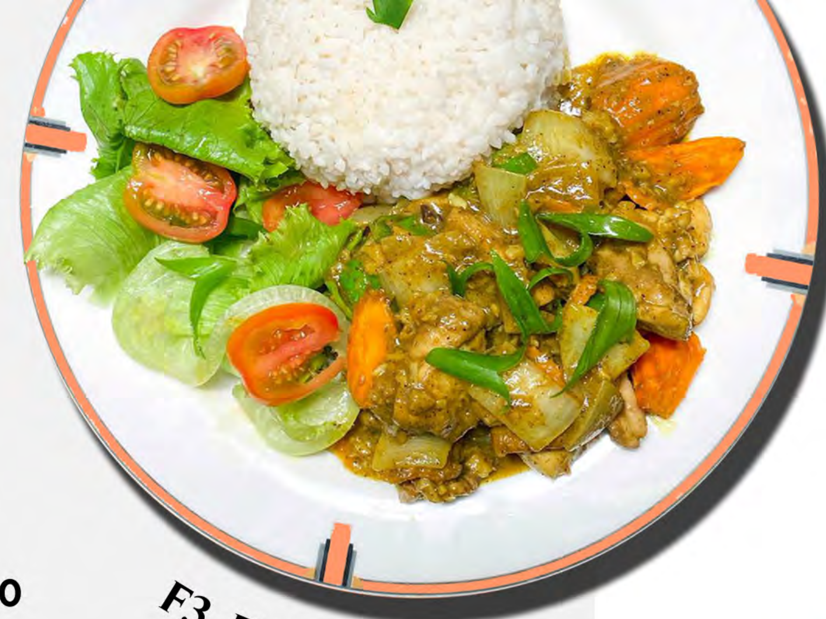
F3. FISH CURRY