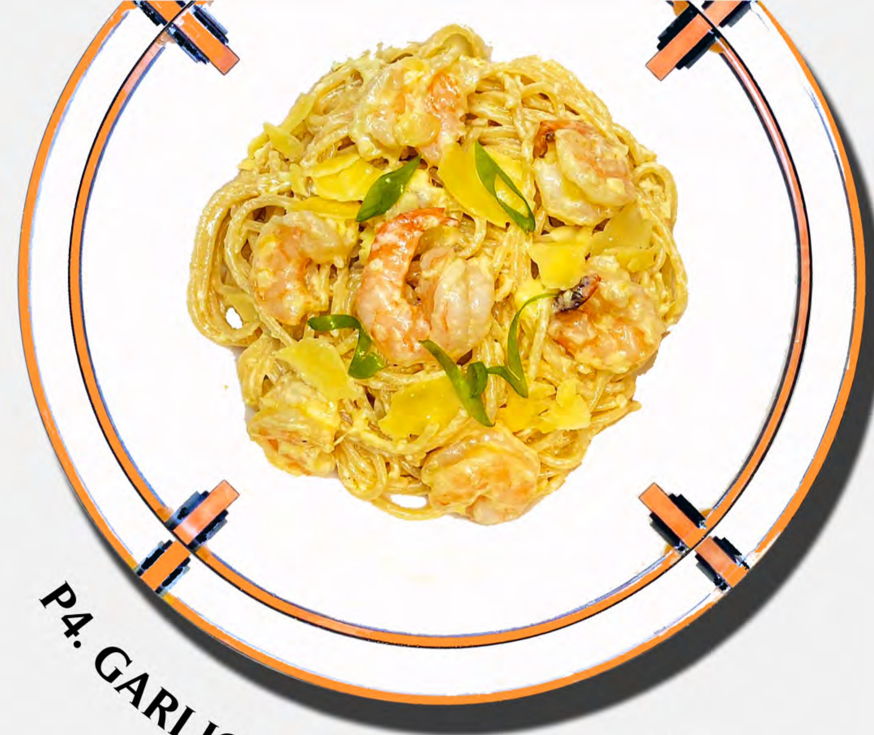
P4. GARLIC PRAWN SPAGHETTI