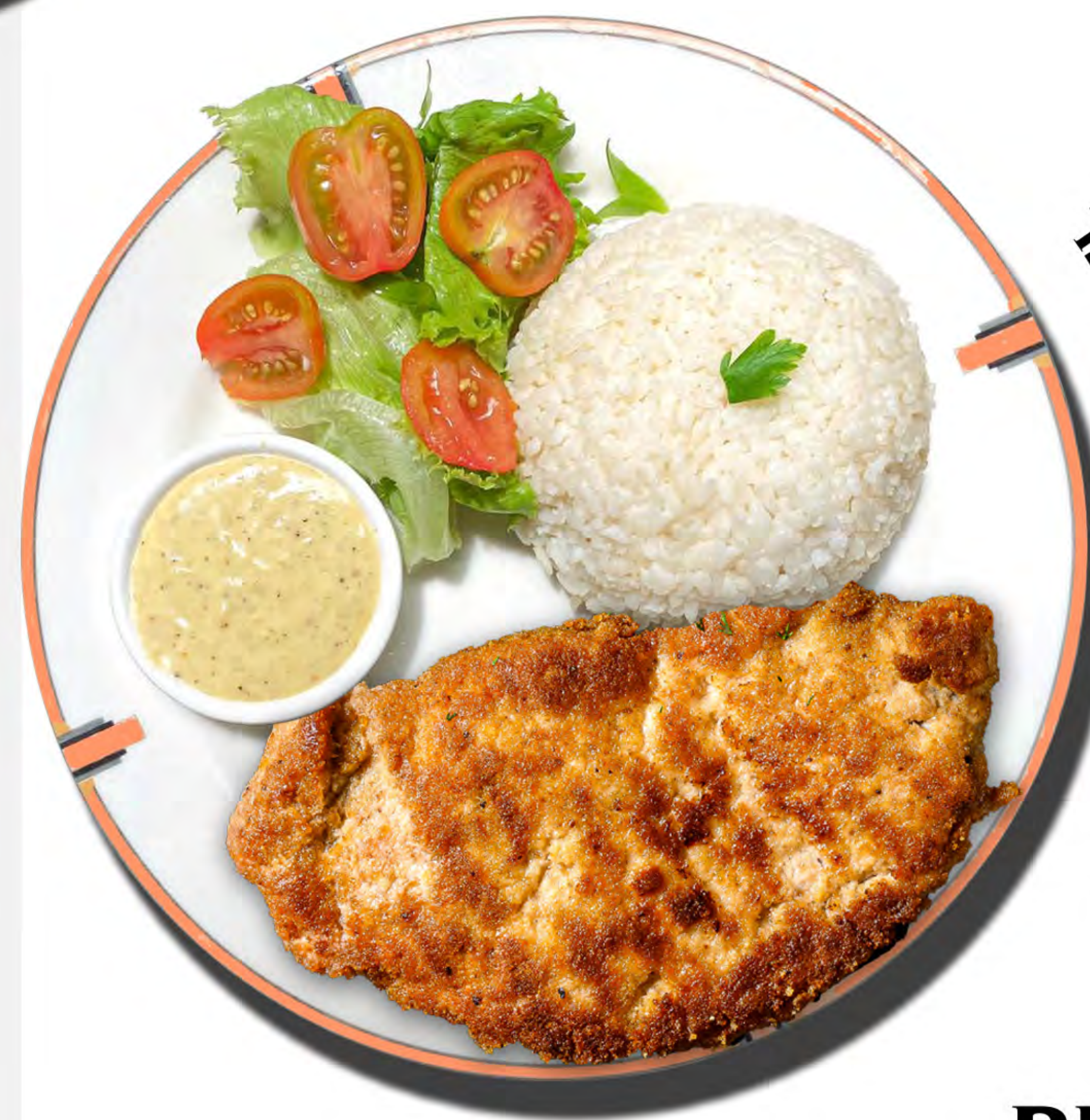
C4. CHICKEN SCHNITZEL