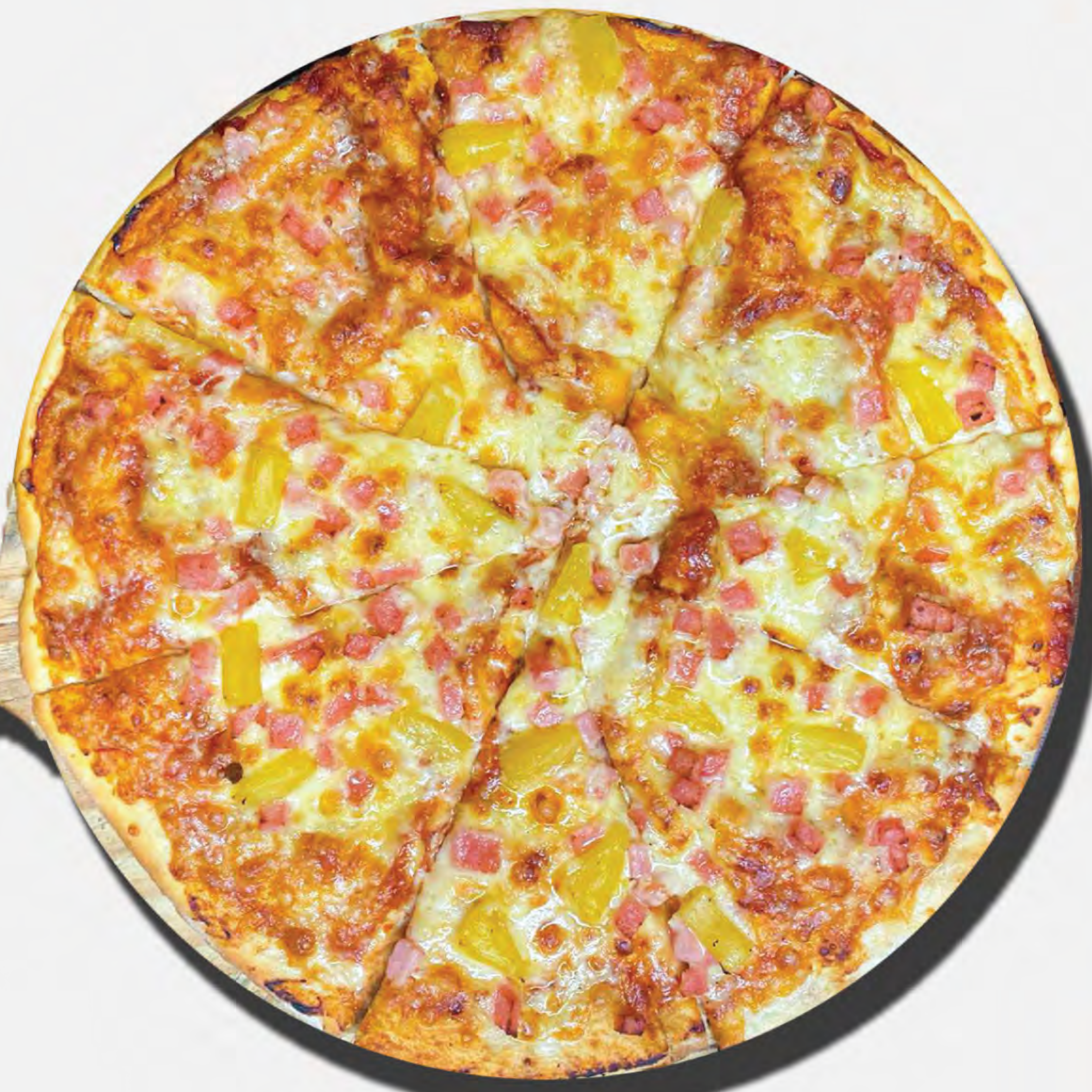
P8. HULA HAWAIIAN