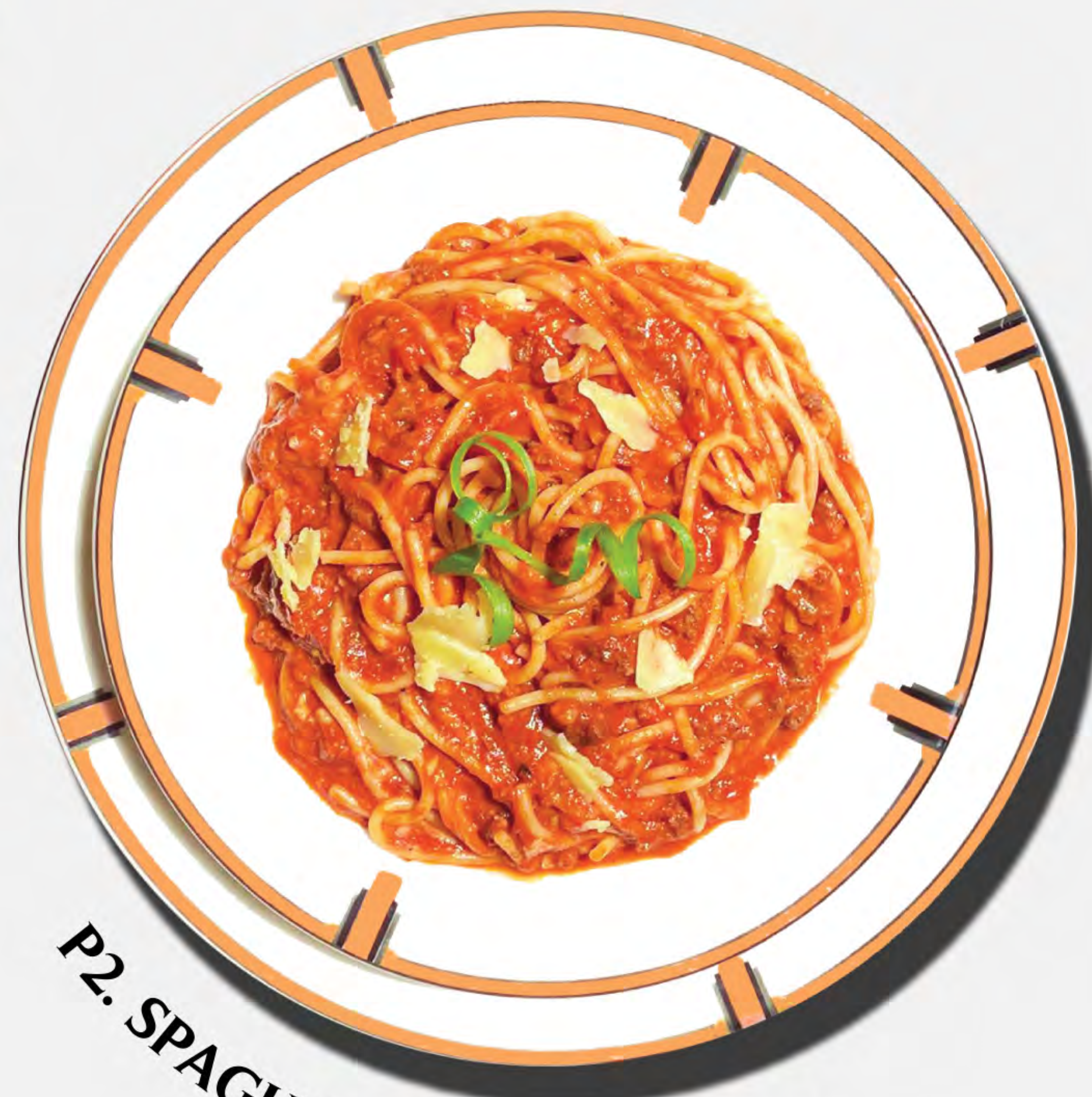
P2. SPAGHETTI BOLOGNAISE