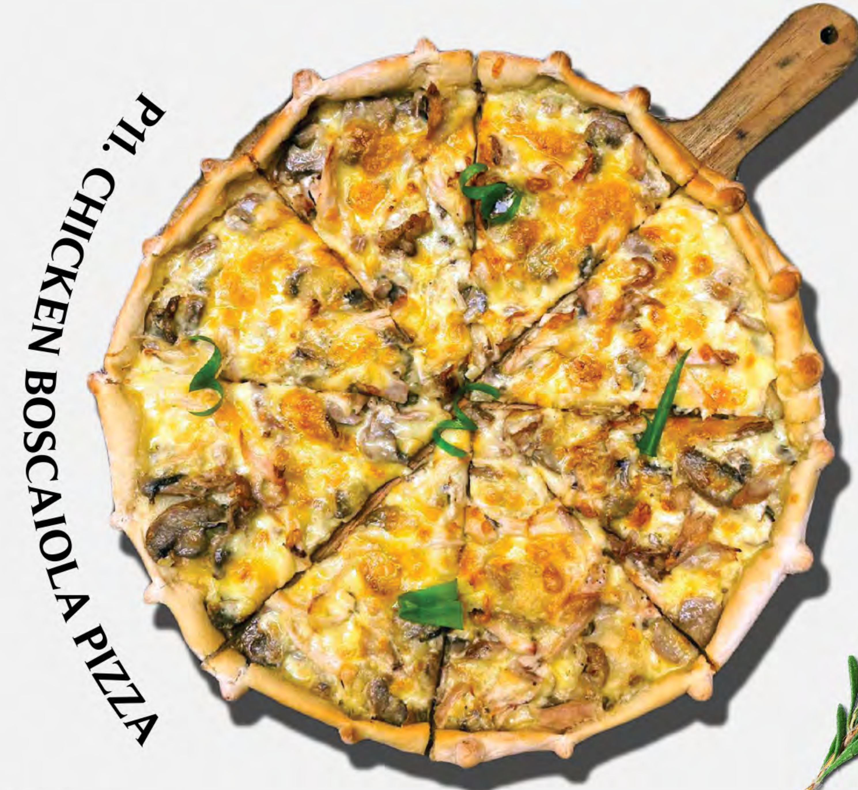
P11. CHICKEN BOSCAIOLA PIZZA